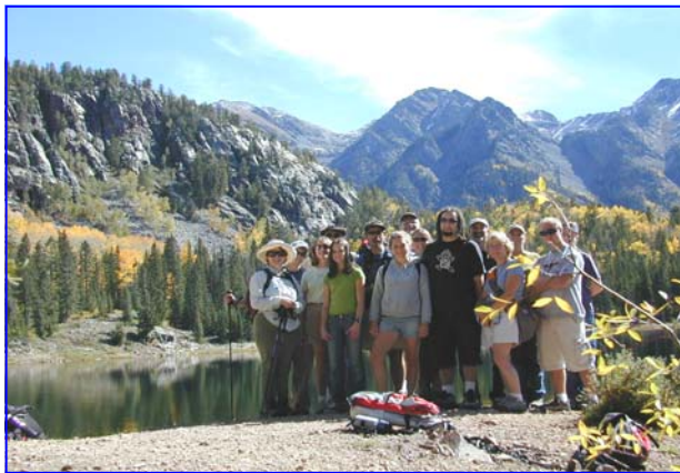
Family Weekend Hike 2005

Families are invited to visit their students and experience campus life in full swing when the golden aspen trees are at their best. We invite you to attend classes (with professor's approval), athletic events, go on hikes, and meet your student's friends. Most students really look forward to having families come for this weekend. For more information go to: www.fortlewis.edu/visitors_parents/family_weekend