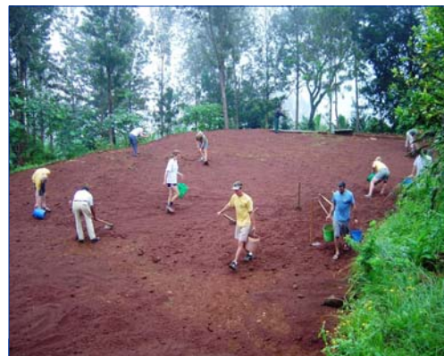
Besides climbing, Outdoor Pursuits team members planned, facilitated and implemented three service projects during the 39 day expedition. Here, the team is spreading and compacting gravel on the newly constructed basketball/net-ball court at the Kidia Secondary School in Kidia, Tanzania. July 22, 2006.

"To you it might seem to be only an exercise, but to us it is the Golden Fleece," a tablet presented to the team by the villagers read. "The efficiency with which you work is beyond comprehension and the product is marvelous. We even thought you were some kind of soldiers only to learn that you are ordinary rock and mountain climbers."