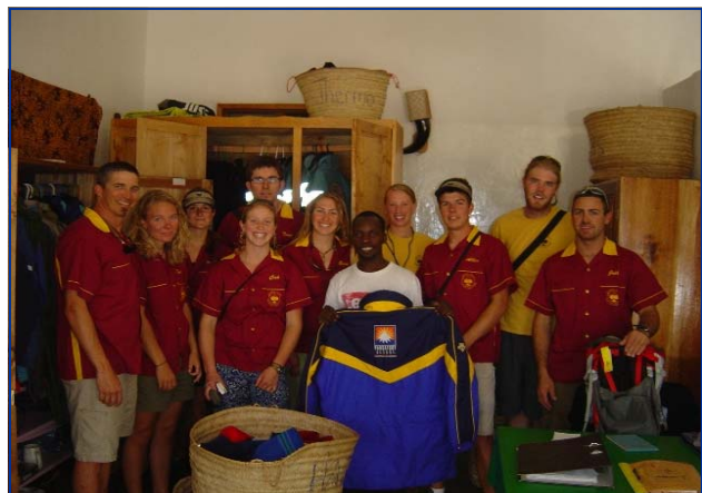
ACE Team members presenting retired Purgatory uniforms to the International Mountain Explorers Connection's Kilimanjaro Porter Assistance Project (KPAP) office manager. The ACE Team facilitated the donation of over 200 articles of outdoor gear to KPAP. KPAP loans outerwear and gear free of charge to porters to insure that they are properly equipped.