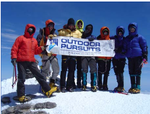
The Outdoor Pursuits team on the summit of Europe's highest peak, Mount Elbrus (18,510 feet and ~15° below zero). Elbrus is located in the Caucasus mountain range of the Russian Federation. July 5, 2006