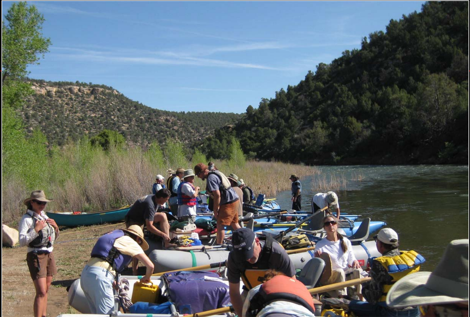
Getting organized to start the trip...