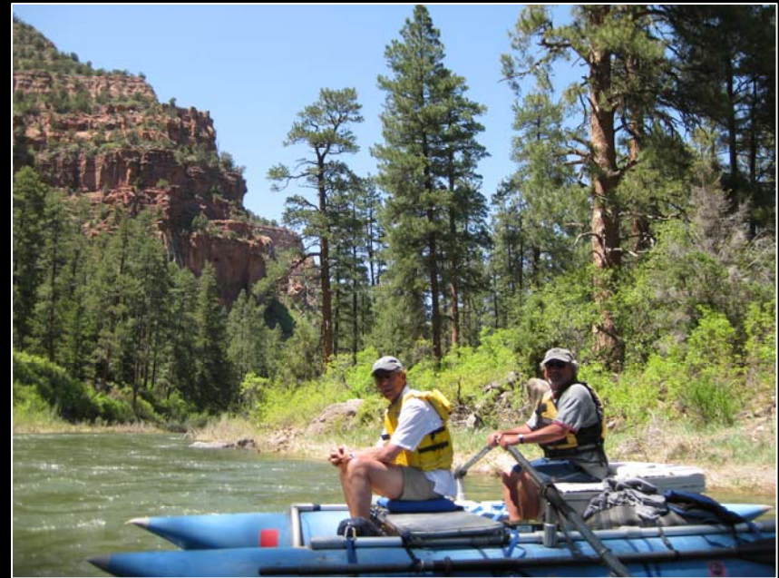
Back on the river & into the red rocks