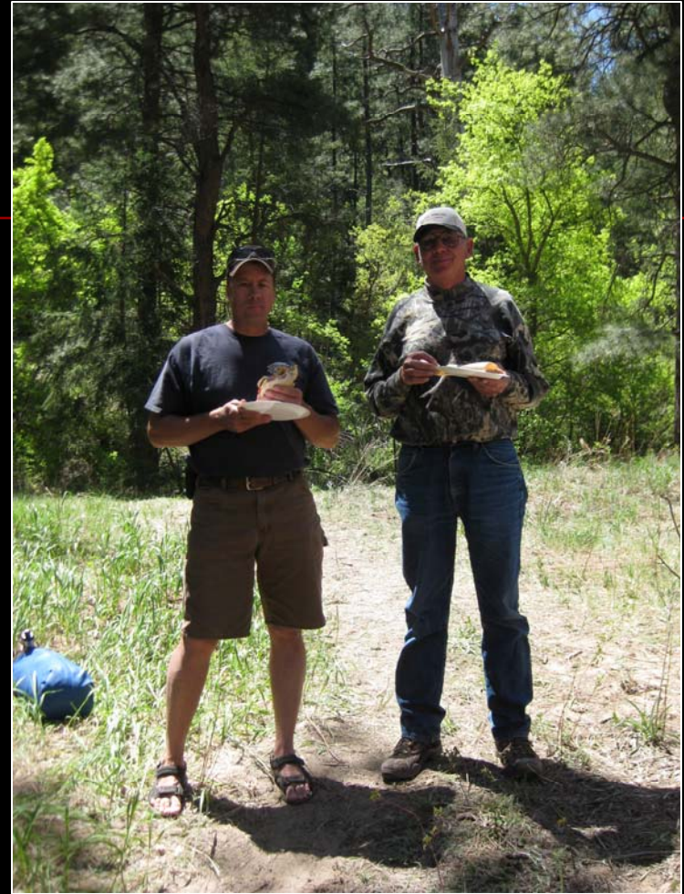
Breaking for lunch...